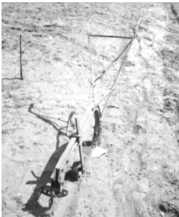
Single duckfoot tine mounted on a plow beam for weeding

of the loans to the smallholder farmers are to purchase new implements and draft animals. There is also some vetting as to who should be given the loan by Lending Groups, AFC and the Agritex staff. The loans are medium-term, and the repayment period is within 3–5 years.