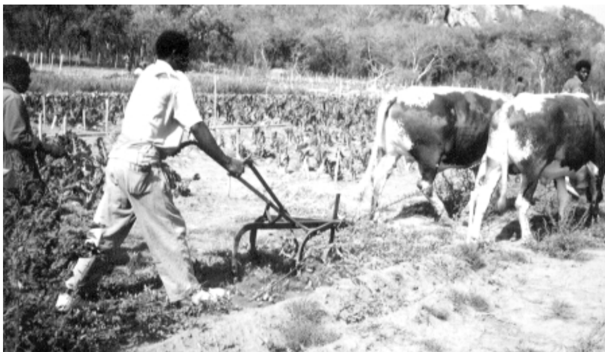
Three-tine weeder made by Bulawayo Steel in use in Zimbabwe

Blacksmiths only produce implements through placed orders unless a high demand is anticipated.