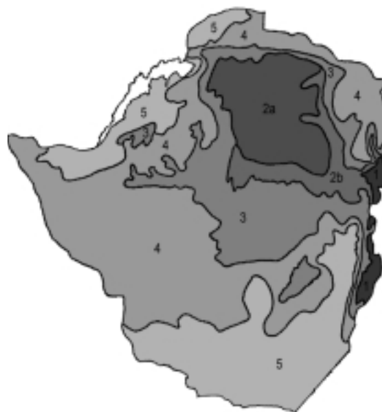
Figure 1: Agro-ecological zones of Zimbabwe

Agriculture in Zimbabwe is broadly divided between two major farming sectors: smallholders, and state and commercial enterprises. There are numerous differences within the farming sectors, but the two main characteristics are land tenure system and size of landholding. In the small- and large-scale commercial farming system, land is owned by